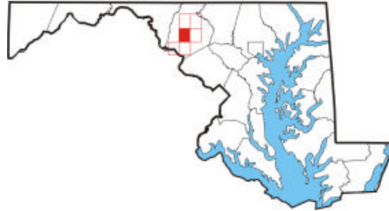
Figure 1. Location map of the six 7.5-minute quadrangles mapped in the Frederick Valley. The Frederick 7.5-minute quadrangle is highlighted.